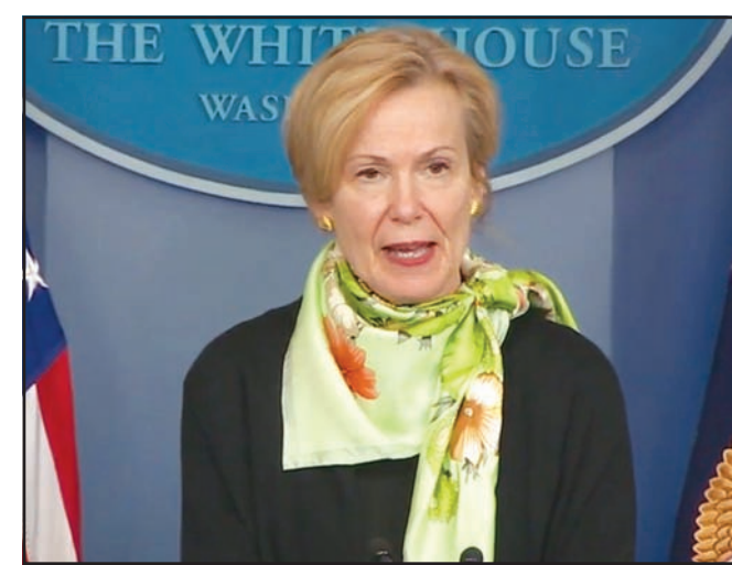
Dr. Deborah Birx, the Coronavirus Response Coordinator appointed by the White House, speaking in the April 16 "Opening Up America Again" press reveal.

"Georgia will utilize the administration's guidelines and collaborate with health and emergency management officials to develop a plan, safely See Opening Up America, Page 2A